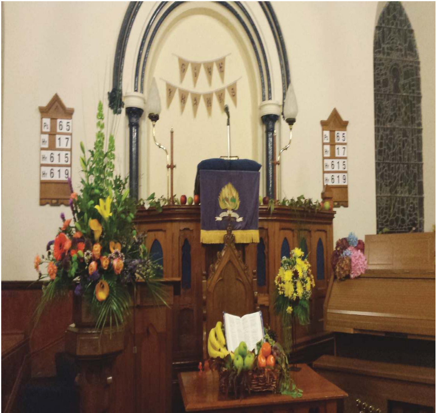
Kerrykeel Presbyterian Church