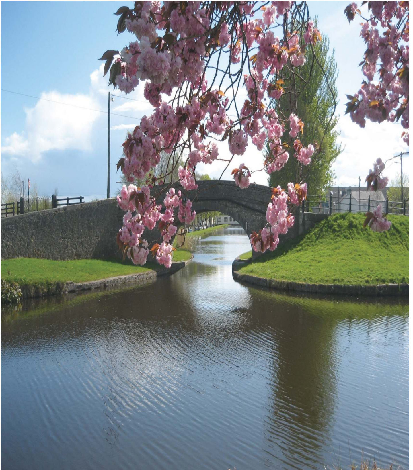
Mullingar, Co Westmeath.