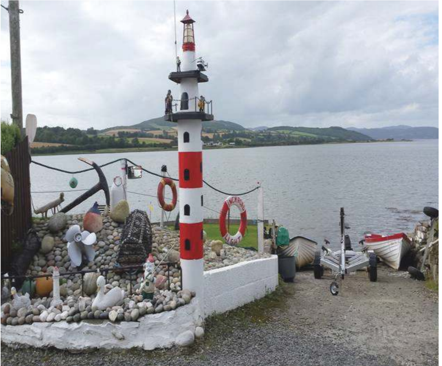
Permission to use this picture given by Joe Robinson: the creator of the lighthouse and boats, Inch Road, Burnfoot, Inishowen.