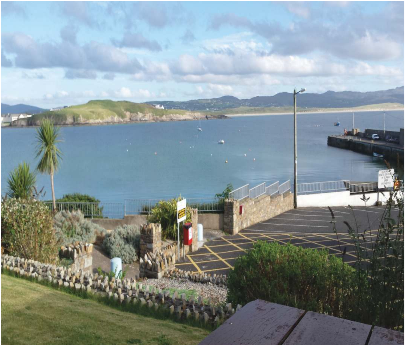
Downings, Co Donegal