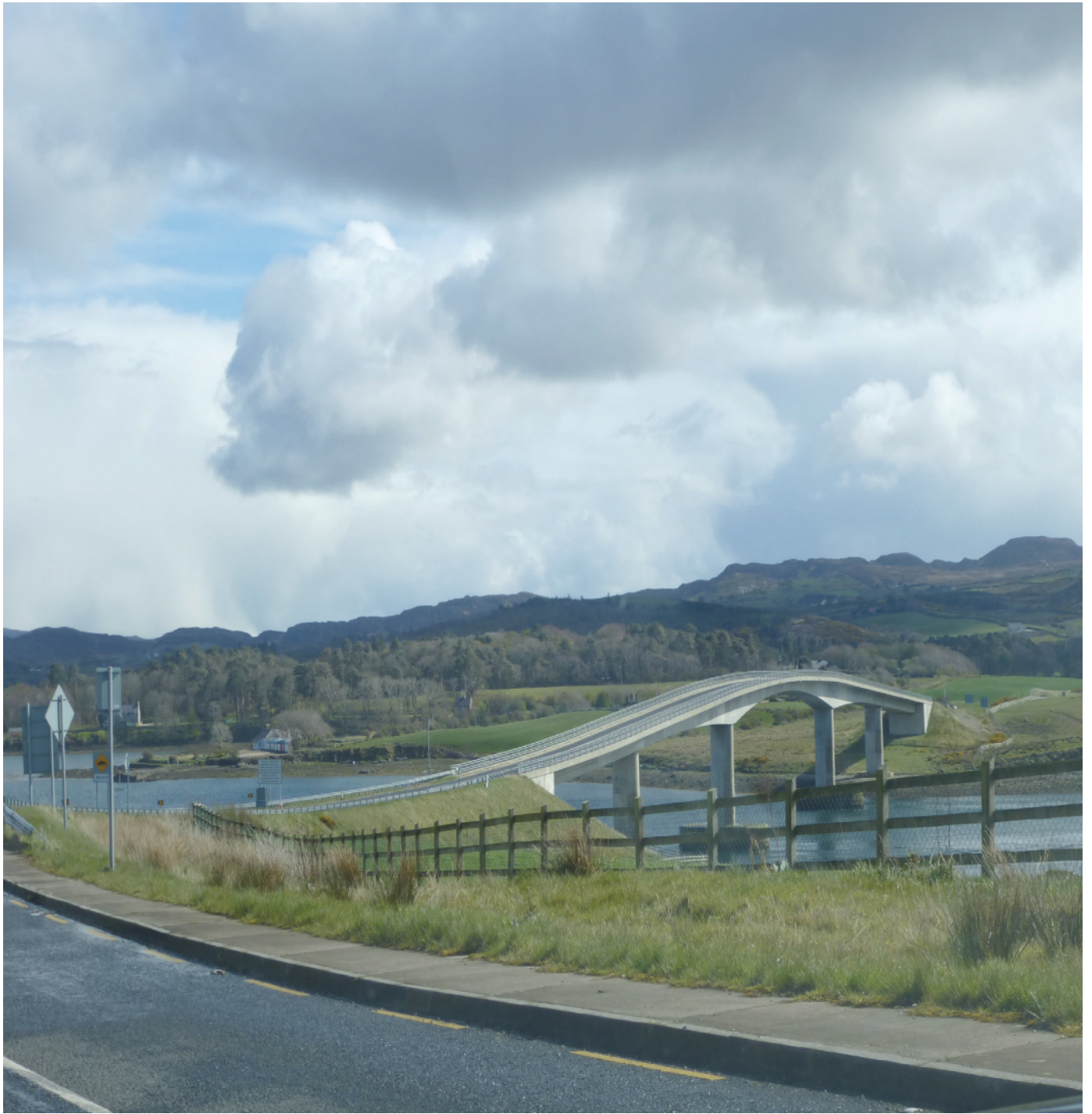
The Harry Blaney Bridge on the Fanad Peninsula