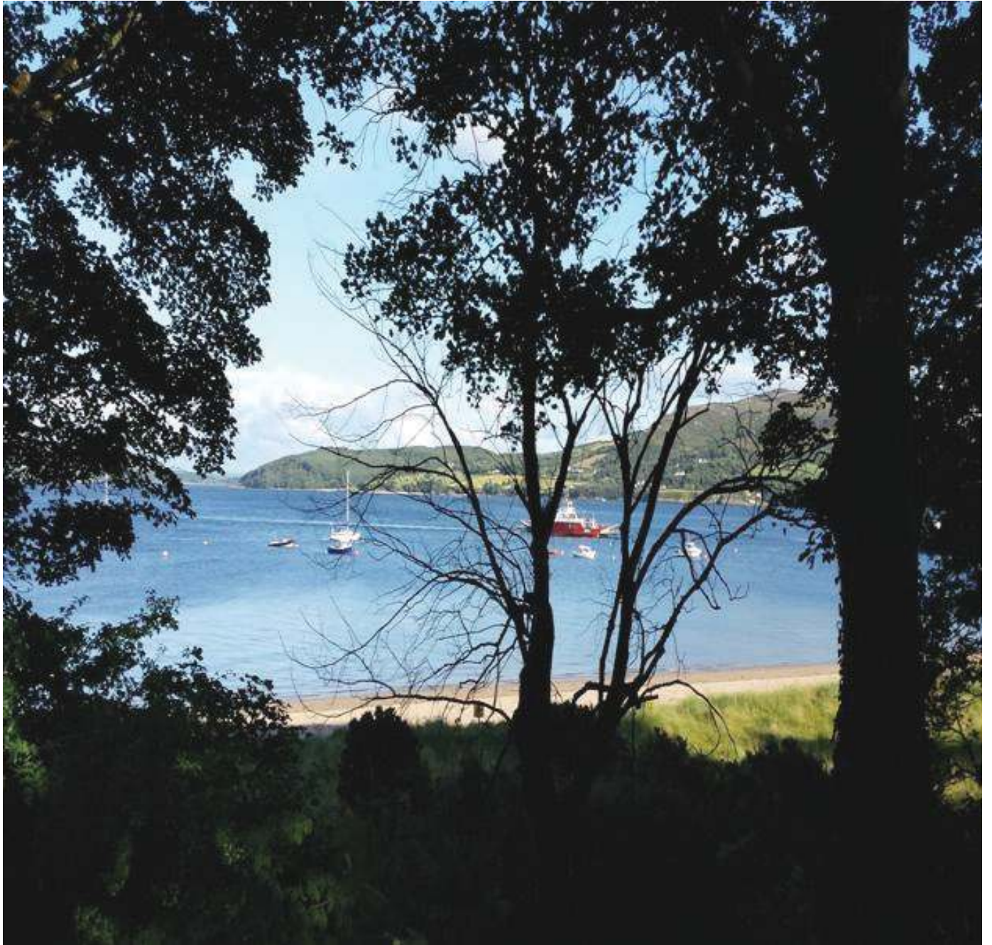
Taken from Batts Walk, Rathmullan, Co Donegal