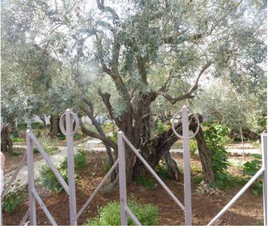
The Garden of Gethsemane