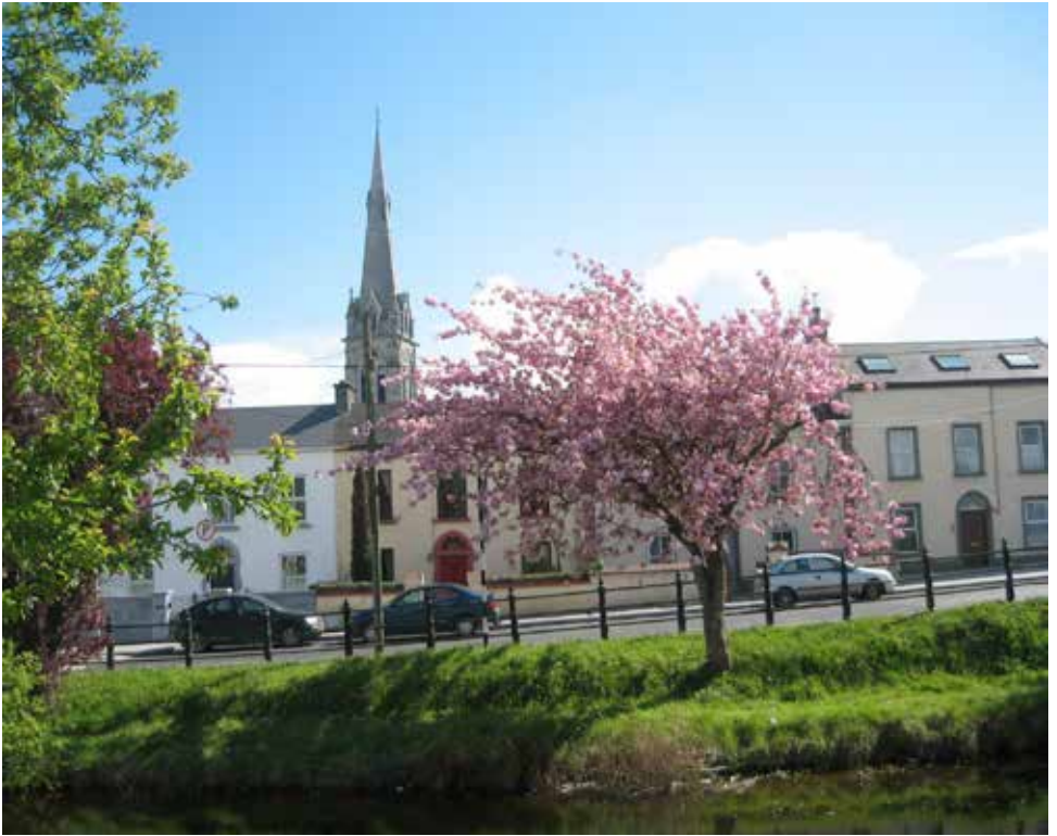
Mullingar, Co Westmeath