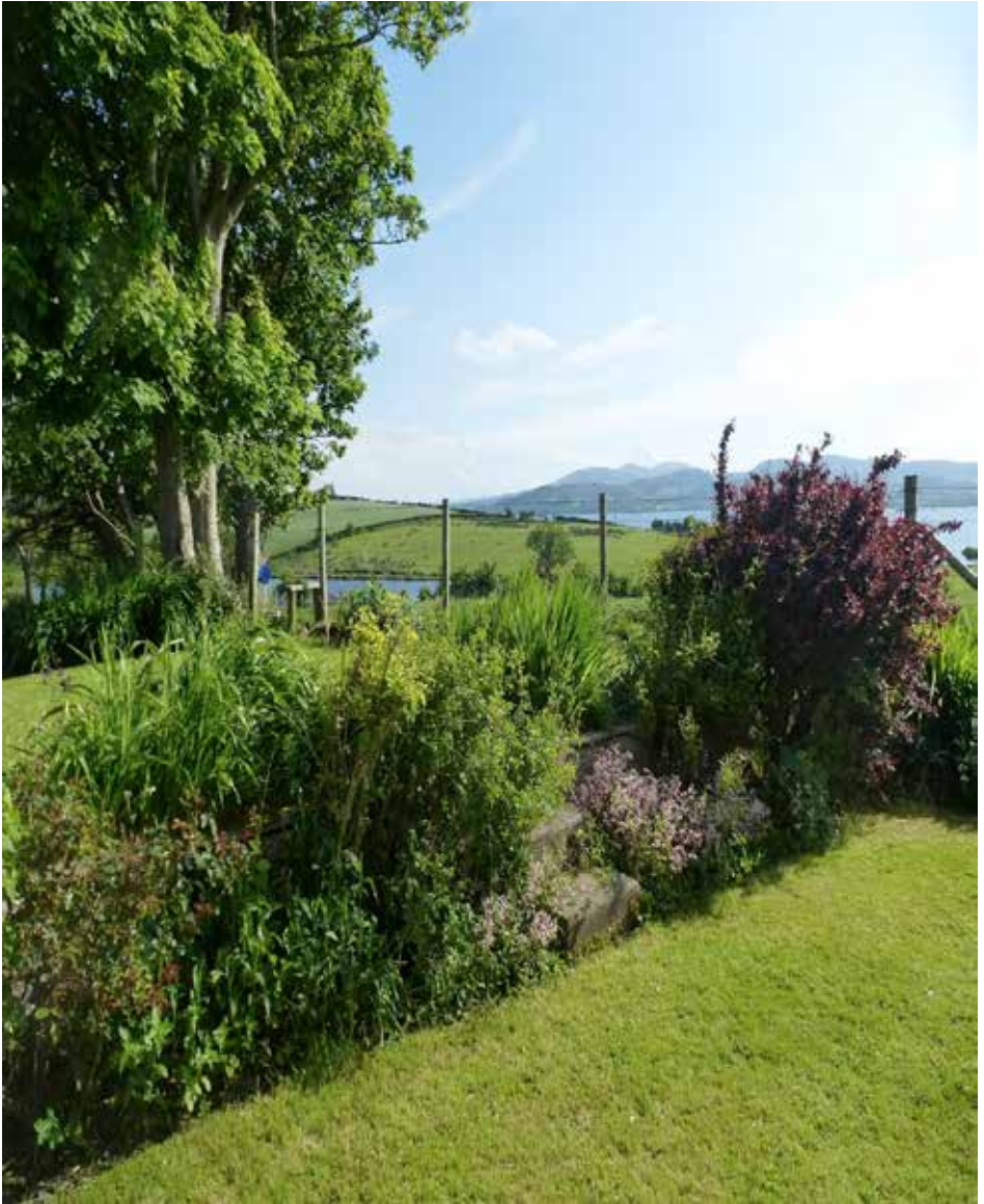
Our garden, overlooking Mulroy Bay and the lake on our farm called The Meadows Trout Fishery.