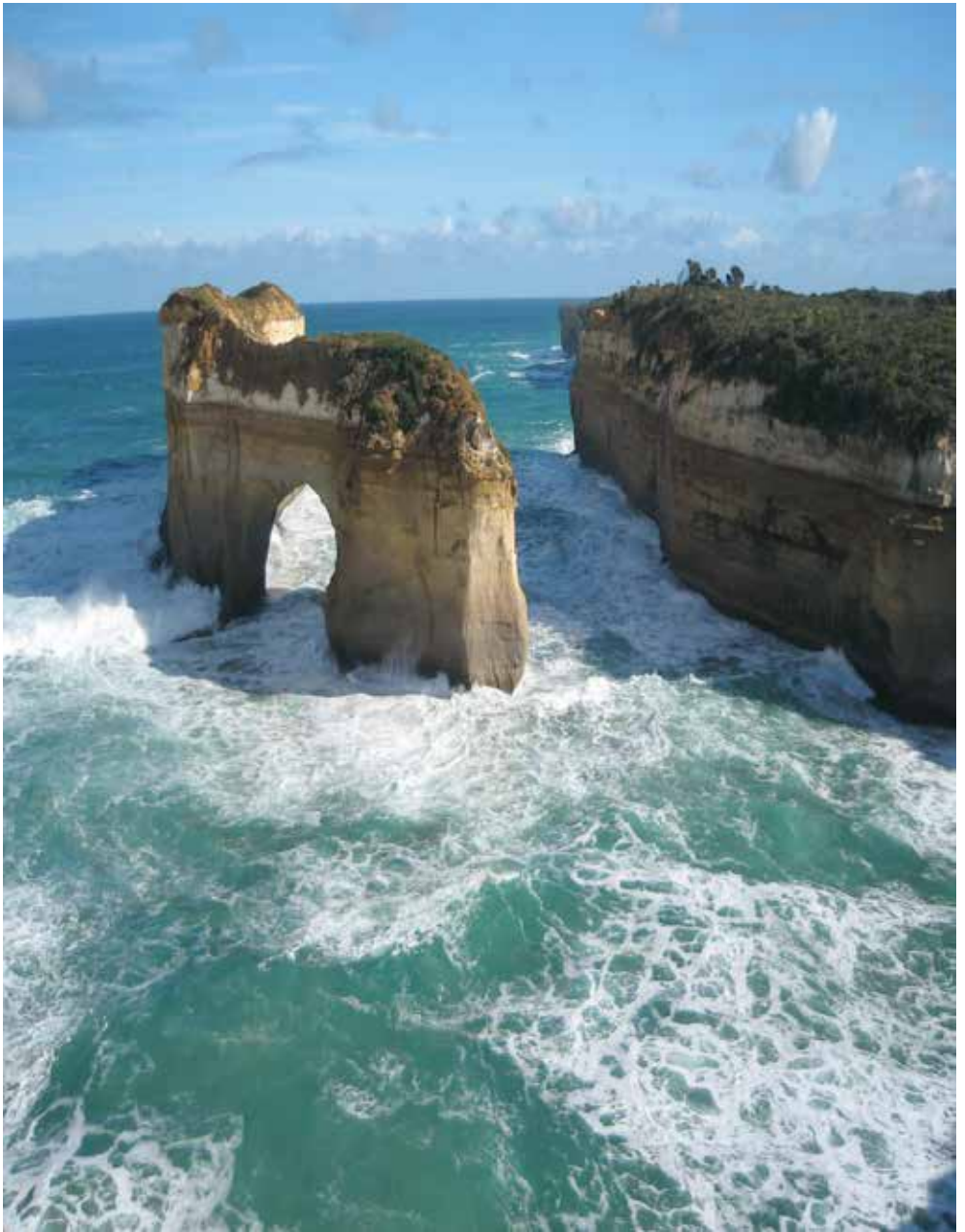
This picture was taken in Australia