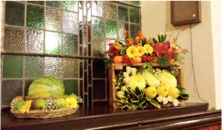
Harvest Thanksgiving decorations in our church

Always be there to lend a hand, Be the person, who will help another stand, Choose to do right instead of wrong, Develop relationships that are happy and strong, Make this world a better place for the hurting, human race.