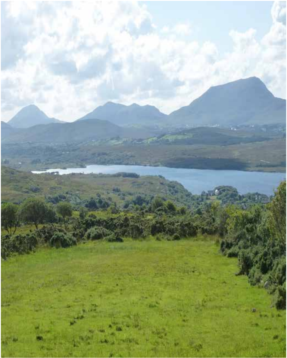
Errigal Mountain to the left, Muckish Mountain on the right.