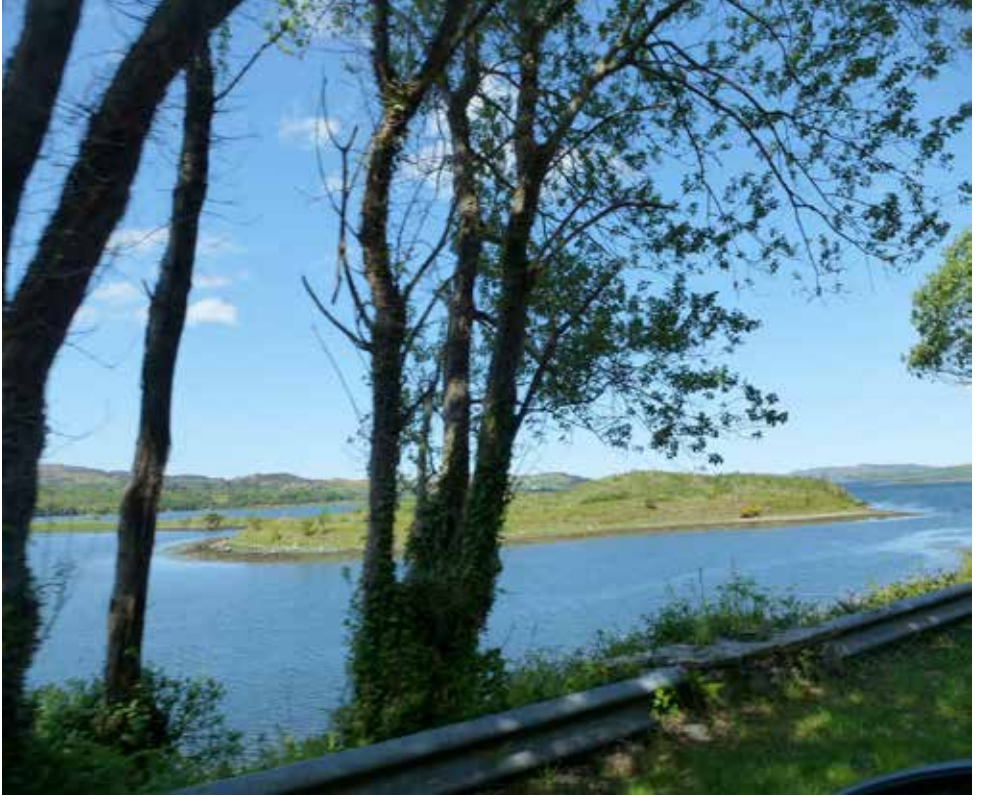
Mulroy Bay, near Kerrykeel.