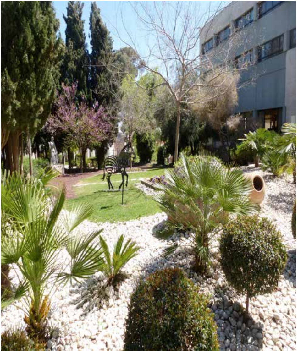
Taken in Australia