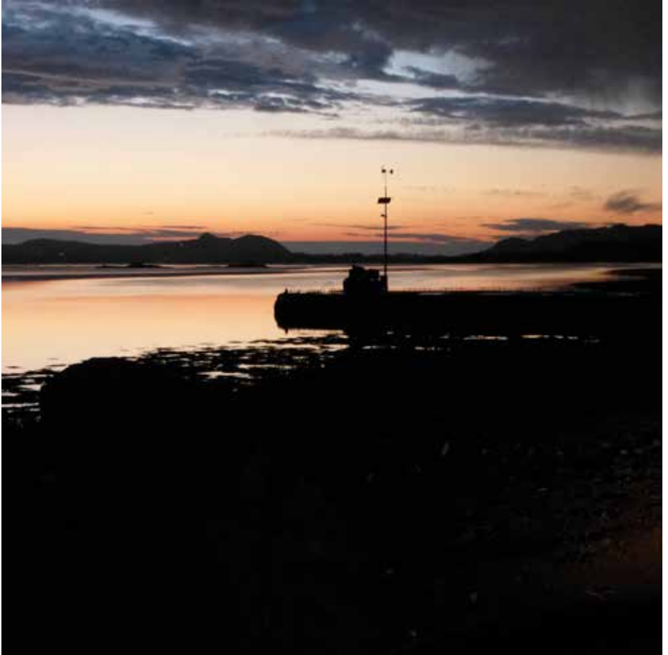
Mulroy Bay, Kerrykeel