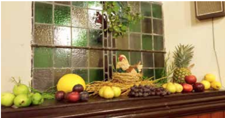
The Harvest Thanksgiving in our church

Have you ever considered the awesomeness of God? The One who created all with nought but His Word, From the high, high mountains to the rolling seas From the birds in the sky to the tiny bees, From the amazing elephants to the minute fleas, From the sun in the sky to you and to me, How can God speak to individuals all over the earth without a microphone, a telephone or anything else? How can we speak, hear, see, think, walk, feel and do, without having to start an engine and press a button or two? I don't know what you think, but I take a lot for granted yet my body has worked from the moment my life started, I think you and I ought to give thanks and praise, to the One who created us and numbered our days.